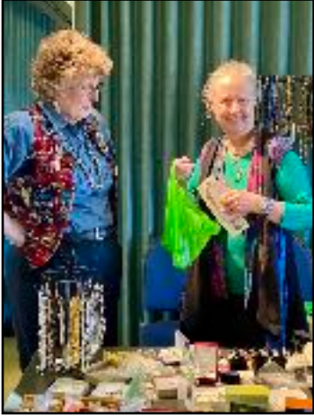
The fabulous Annual Christmas Fair!