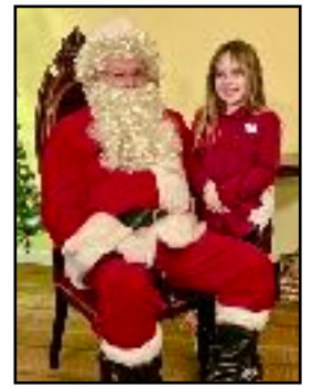
Supper with Santa!