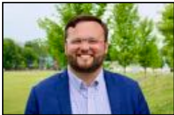
State Rep. Sean Reid