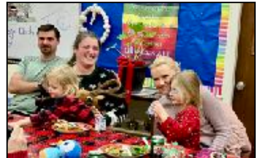
Christmas Eve ☆