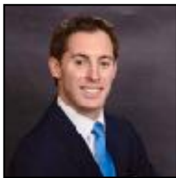
State Sen. Brendan Crighton

Transportation of elders may be arranged by contacting the Tiffany Room a few days in advance of the breakfast. They can be reached at 781-581-7557.